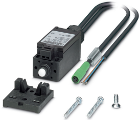
Door position switch with 3 m cable with open cable end and 0.6 m cable with M8 socket (Snap-in), including mounting accessories

Please be informed that the data shown in this PDF Document is generated from our Online Catalog. Please find the complete data in the user's documentation. Our General Terms of Use for Downloads are valid ( http://phoenixcontact.com/download )